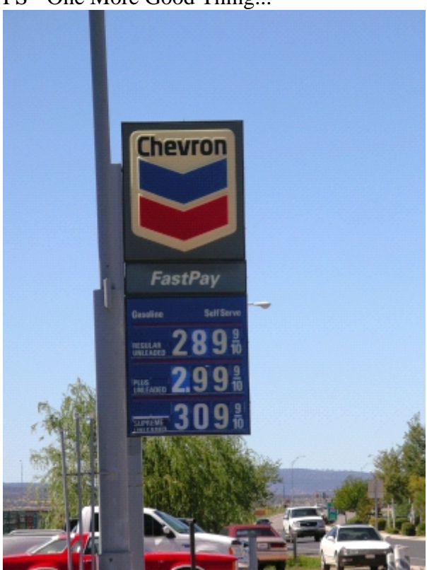
PS - One More Good Thing ...