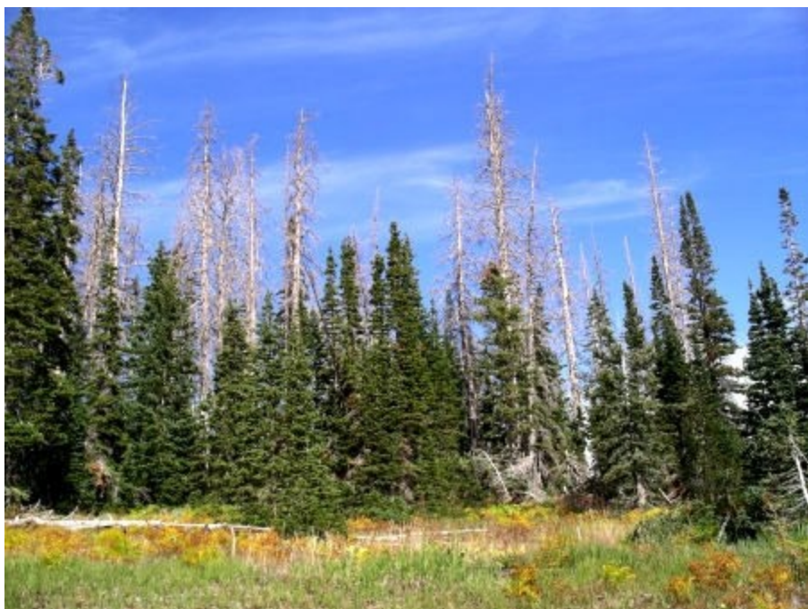
Kolob Canyon (North Zion NP)