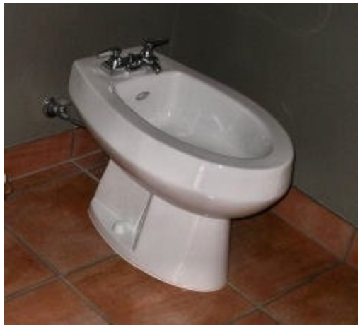
What do the French do with these things? Maybe that's why they won't make eye contact.

No broadband in Boulder. Gonna try the phone. This room does have a phone. Otherwise you'll get it late.