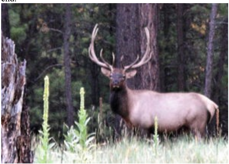
Elk - U.S. 180. Just up the road from an SUV with a crushed front end.