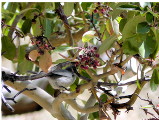
Bird in Texas Madrone.