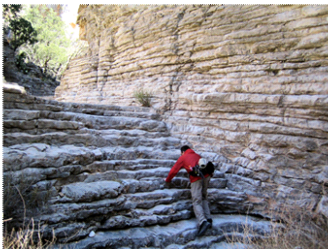
"Hiker's Staircase". Looks like stairs. Hah!