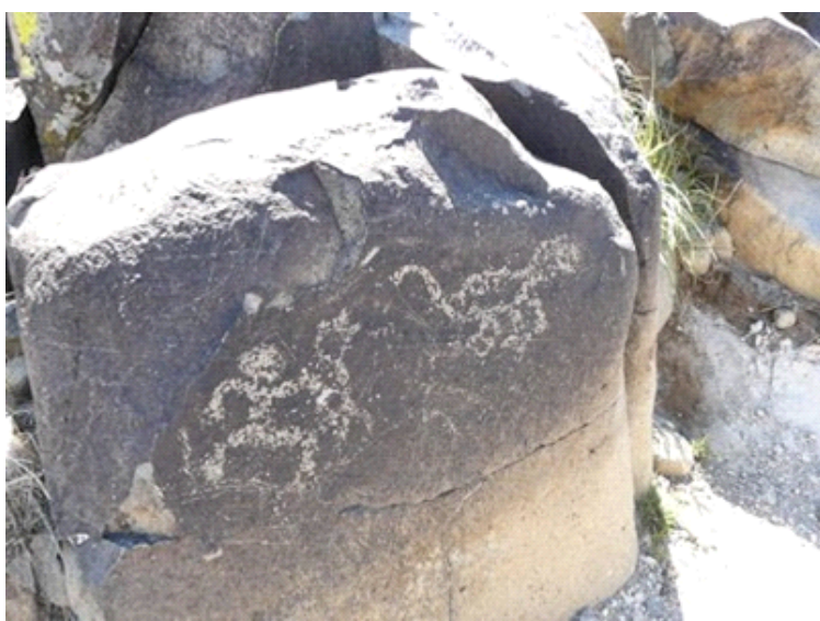
Fred and Barney chasing Dino