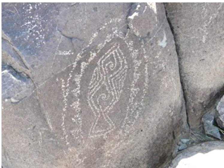
Fish on a platter.