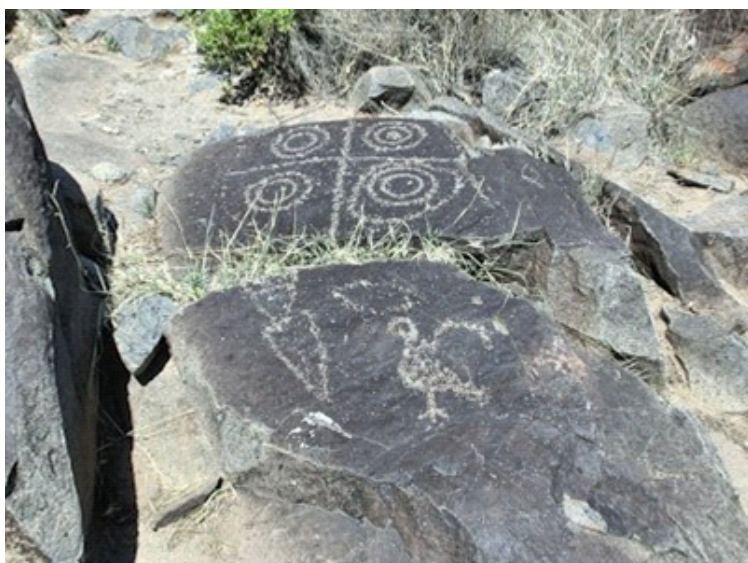
Bird gets a carrot for winning tic tac toe.