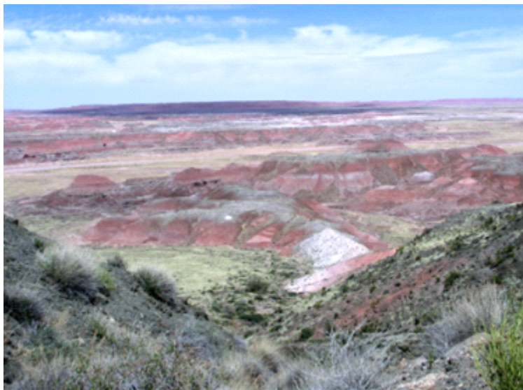
This is painted desert