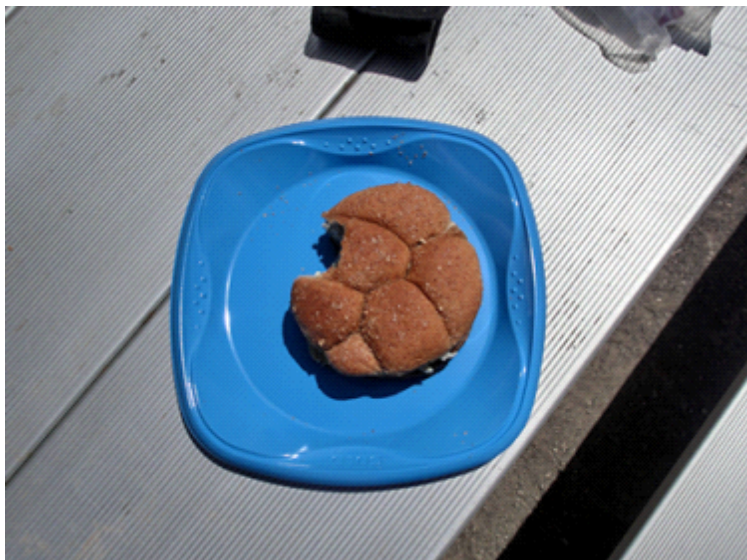
This is lunch