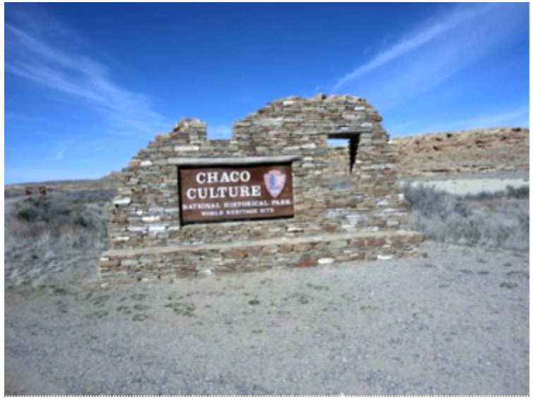
Today kind of slipped between the cracks.