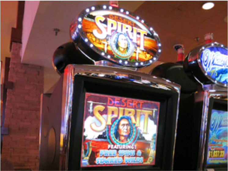
In spite of all this modernization, the basic native character and spirit were clearly evident.