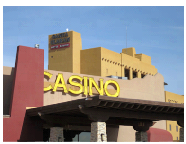
Santa Clara Pueblo buildings still retain that boxy, cliff dwelling look.

Today we had the privilege of visiting one of them: Santa Clara Pueblo.