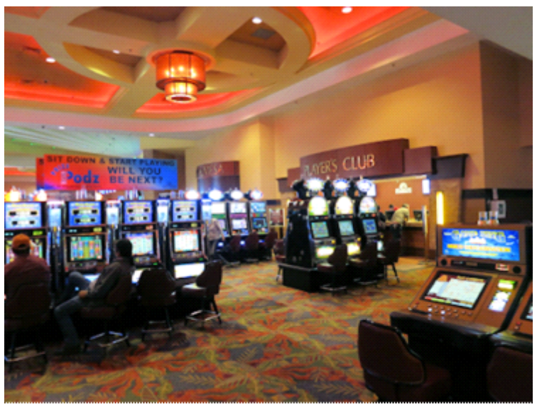
Inside we expected dirt floors or clay tiles and smoky fire pits. Instead there was plush carpet and a luxurious ambiance. There were felt covered gaming tables and rows of slot machines! It was smoky.