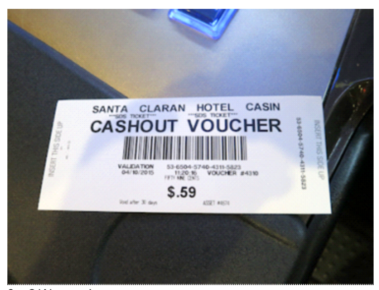
See? We won!