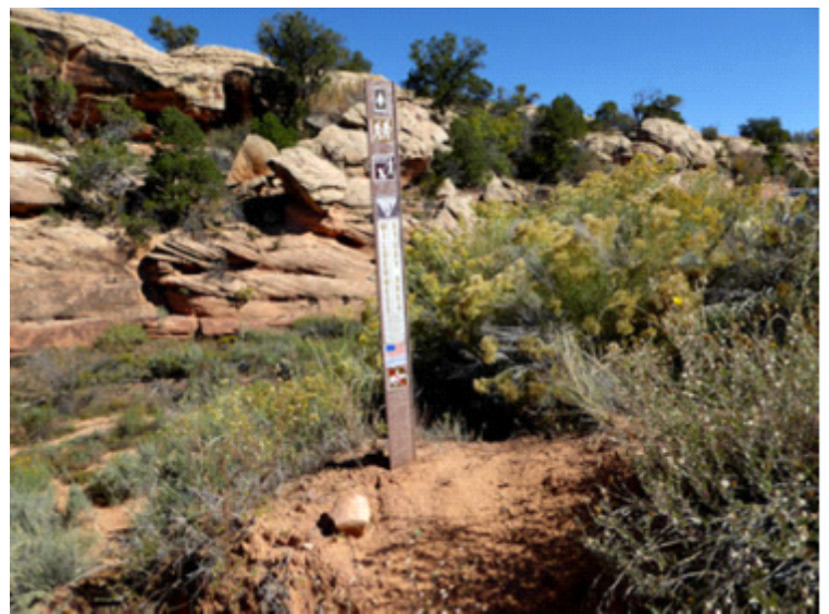
After driving past it a few times we did the unthinkable and asked some guys where it was. Oh, of course.

Today we hiked the south fork of Mule Canyon. Our specific objective, other than being in a wonderful place on a beautiful day, was to see House On Fire ruin. But before you can hike it you have to find it. The trailhead is marked with this skinny 3-foot post along some endless dirt road in the middle of Cedar Mesa.