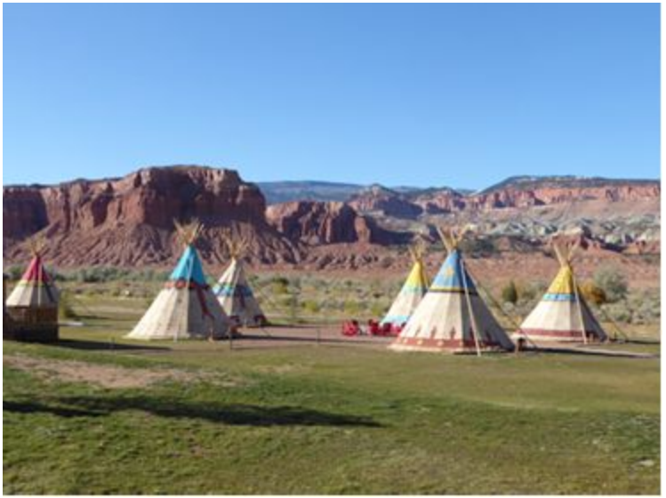
This is the view from our room in Torrey. Looks authentic. We're probably next to a reservation.