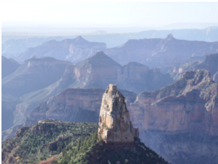
Stopped at Vista Encantada.