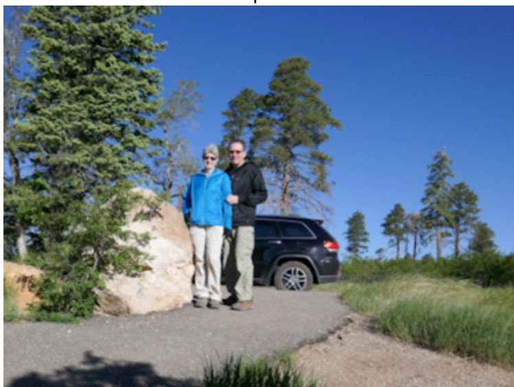
Saw the Walhalla Overlook.