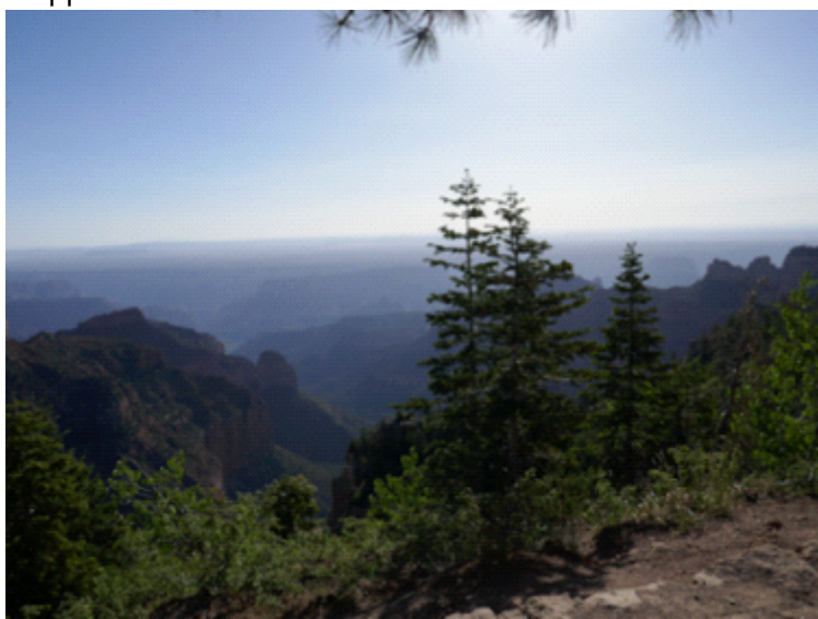
Drove the Roosevelt Point loop.