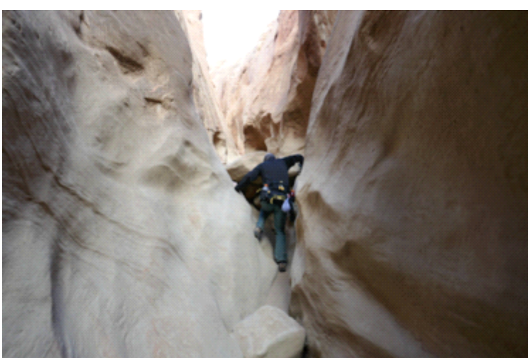
We found the exit at the very end.

And we endeavored to cross over to Spooky.