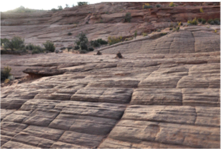
And by the grace of cairns and Vibram we made it down into the canyon and to the gulches.

It is recommended to hike the two gulches in a loop, up the Peek-A-Boo and down the Spooky. Spooky has a 12 foot drop at its base and is best hiked in that direction. We headed up Peek-A-Boo.