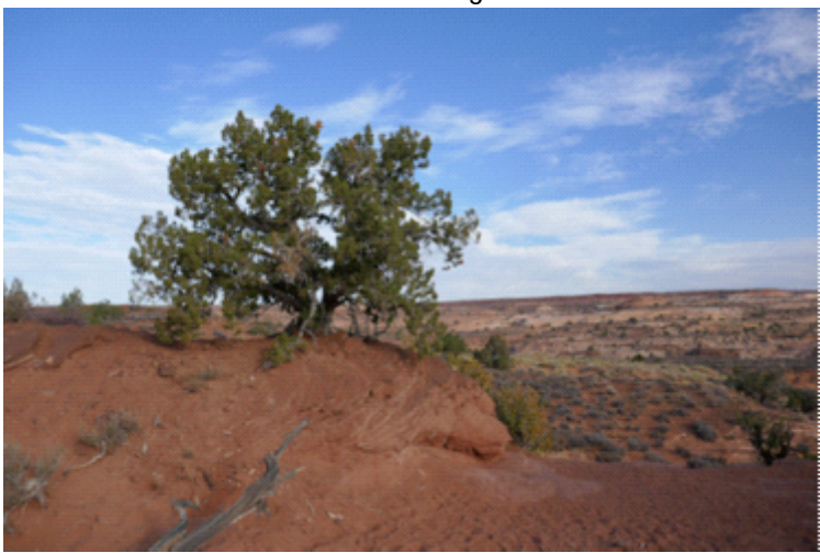
The good news was it was a beautiful day and we enjoyed the hike.

But then sometimes it doesn't. We found a line of cairns at the Peek-A-Boo exit and followed them faithfully. Judging by the multitude of footprints so did a lot of other people. But these cairns led us back to the gulch entrance.