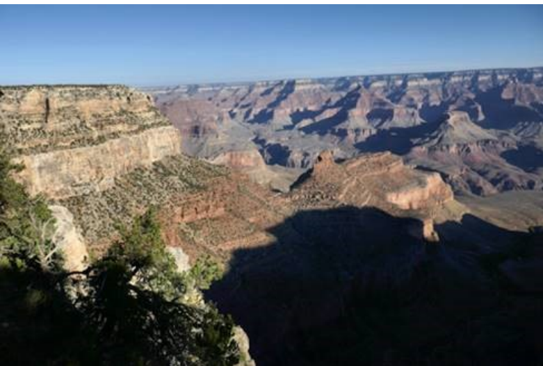
Starting toward Kansas tomorrow.