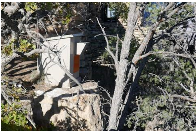
That's a camera.