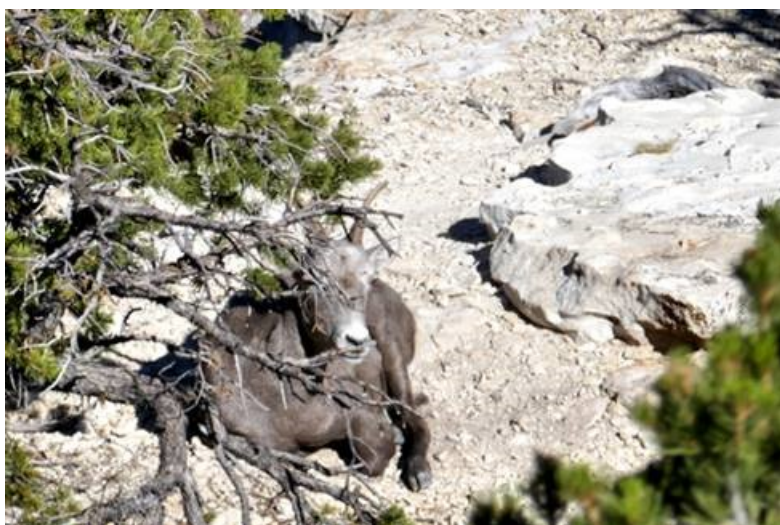
A female bighorn jumped a couple of ledges down from the rim. We stared at her. She stared at us. She won. We left.