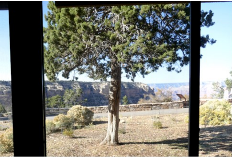
We reserved a room on the parking lot side but the morons put us right on the canyon.