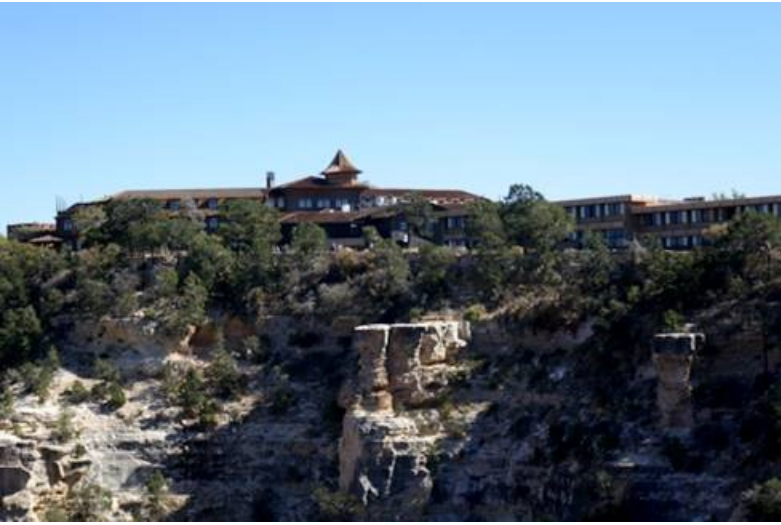
Grand Canyon Village was a zoom lens shot away. We are staying in Kachina Lodge, the squarish building on the right.