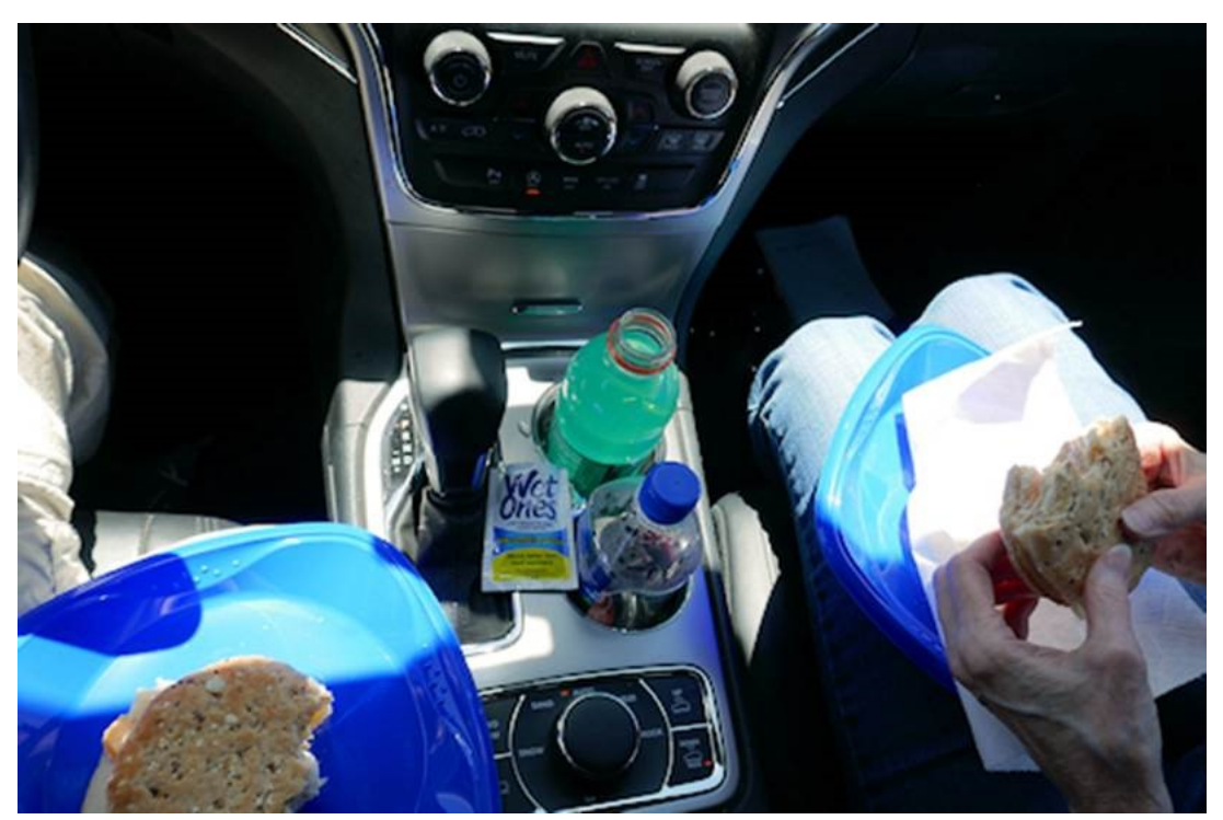
We had tried a couple of restaurants first, but oops, good luck there, it's Mother's Day.