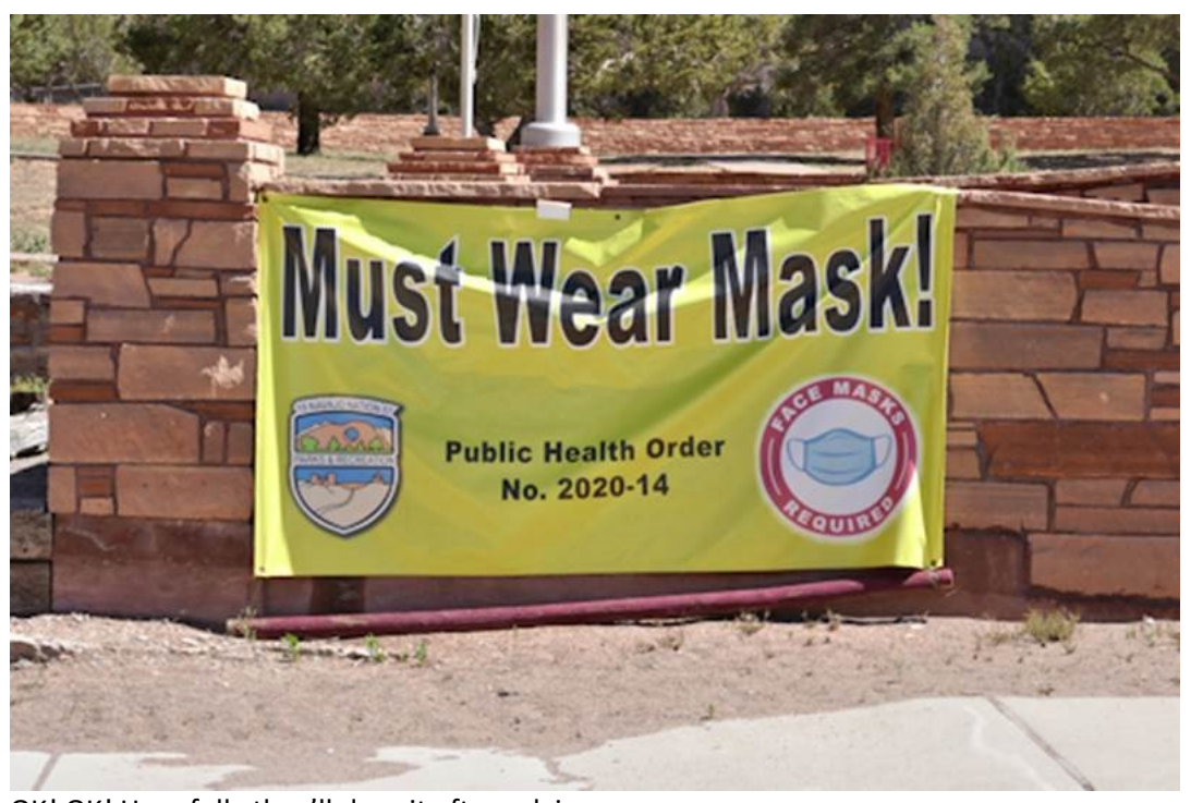
OK! OK! Hopefully they'll drop it after calving season.

We drove to Gallup. The wind became hellacious.