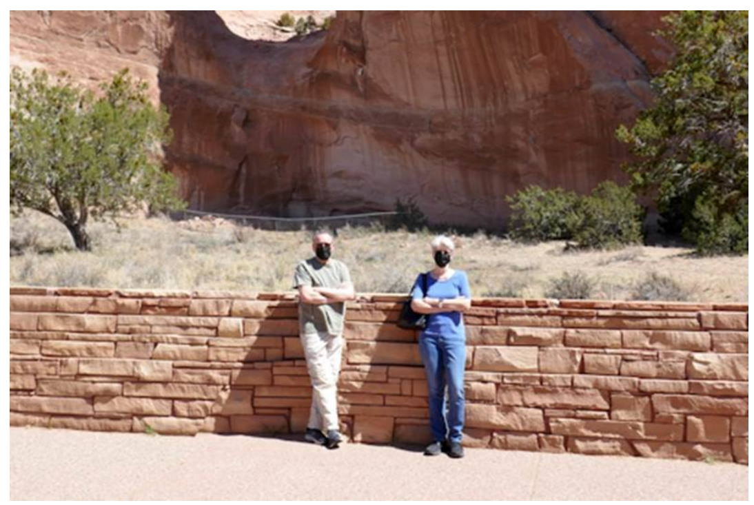
We posed in front of it wearing our covid masks which were subtly suggested for park visitors (see next picture).